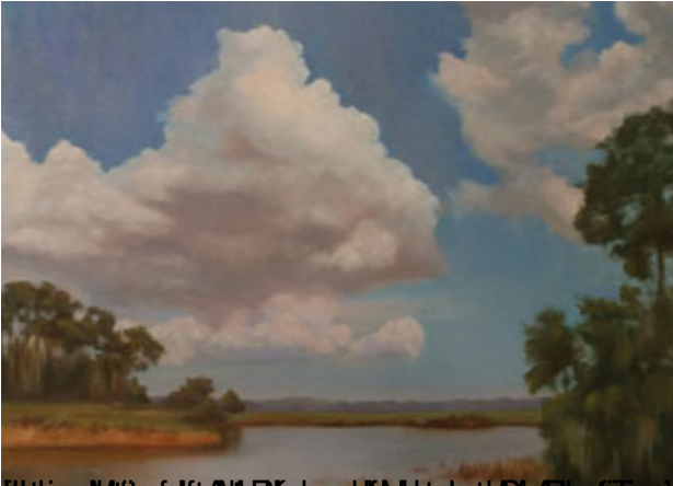
John Constable, Large Cowslip Field , 1802, oil on canvas, National Gallery, London